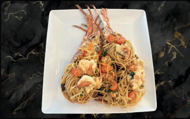
Linguine Lobster (for 2) 2900.-