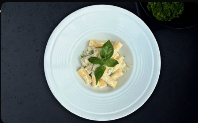
Rigatoni Asparagi, Pea & Mushroom 380.-