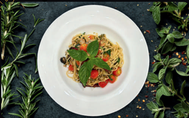
Linguine Tuna & Caper 430.-