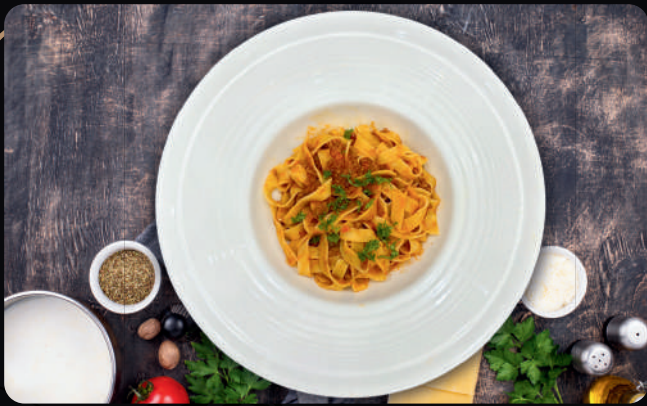
Fettuccine Bolognese 400.-