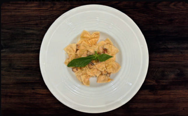
Farfalle Salmon 520.-