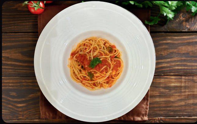
Linguine Pomodoro 350.-