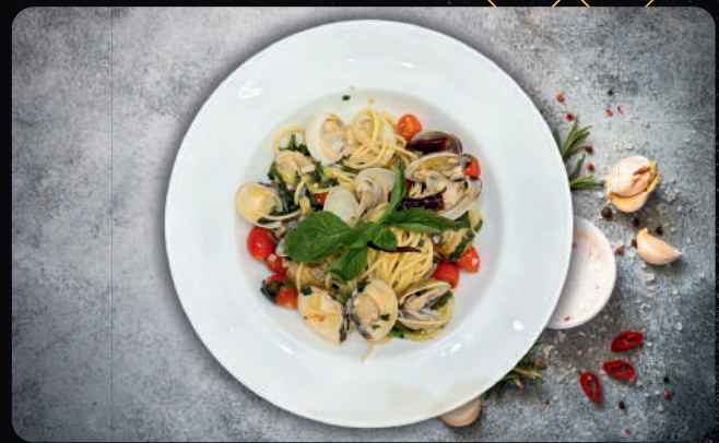
Spaghetti Vongole 450.-