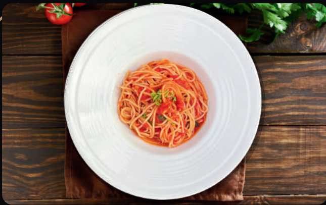
Spaghetti Pomodoro 350.-