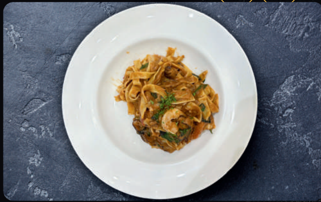
Fettuccine Shrimp & Mushroom 450.-