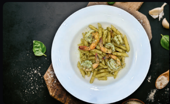
Penne Pesto & Shrimp 490.-