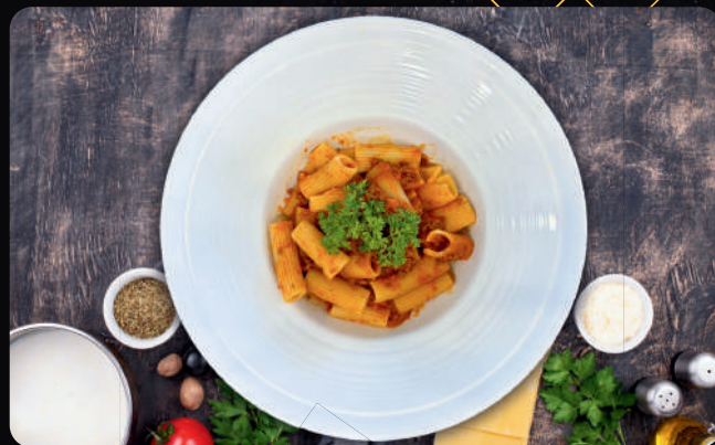
Rigatoni Bolognese 400.-