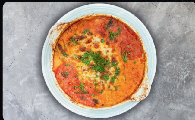
Mom's Lasagna 450.-