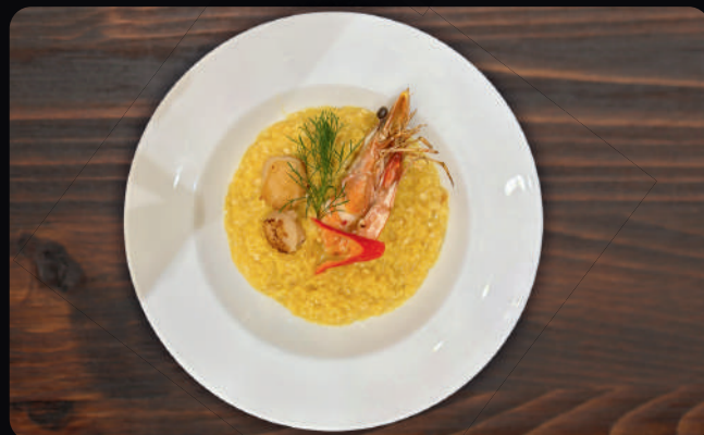
Risotto Saffron Shrimps & Scallops 750.-