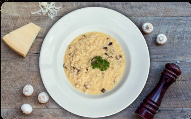
Risotto Mushrooms 450.-