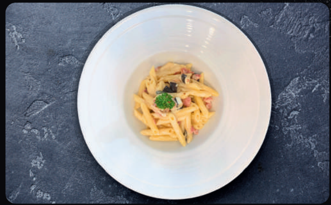
Penne Mascarpone & Bacon 380.-