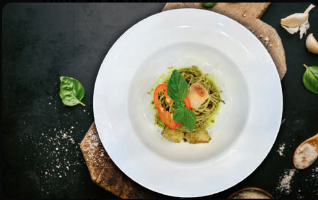
Spaghetti Pesto & Scallops 660.-