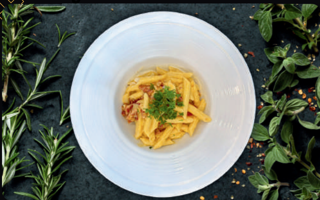
Penne Carbonara 380.-