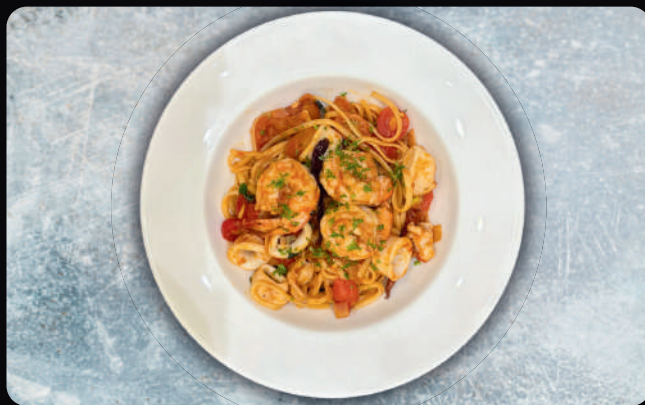
Linguine Seafood 520.-